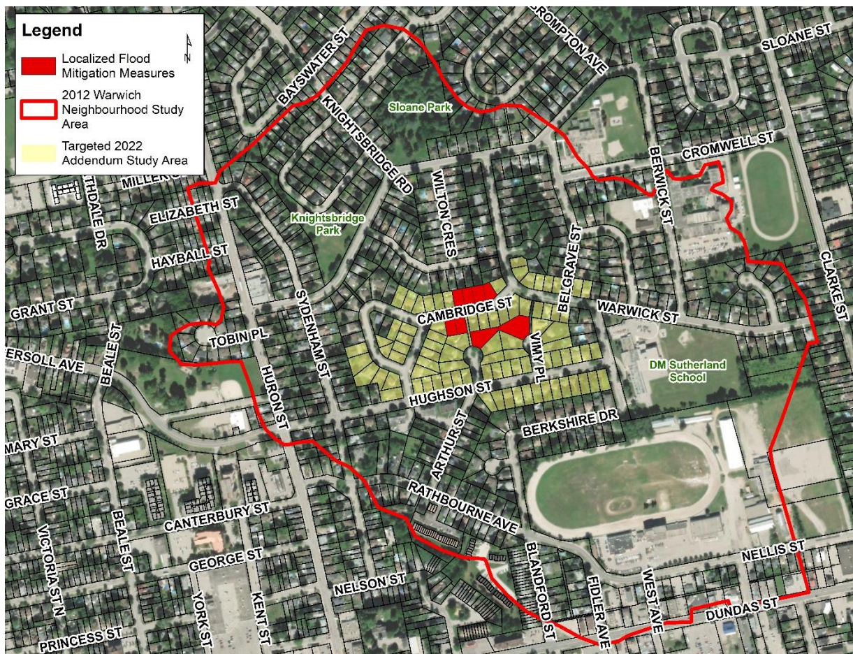
Figure 7-1: Recommended Solution – Properties with Residual Risk