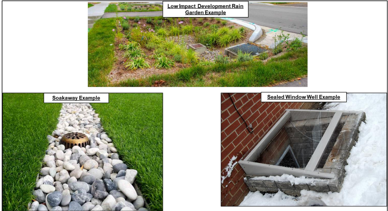
Figure 8-1: Examples of Potential Flood Mitigation Measures

each other and are not required to be completed all at once. This will allow the resident to select a contractor of their choice and the timing of the work as well. Residents will be contacted directly by the City of Woodstock to discuss the work.