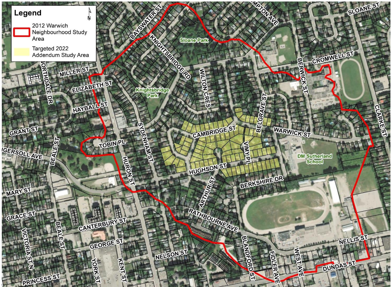
Figure 1-1: Study Areas