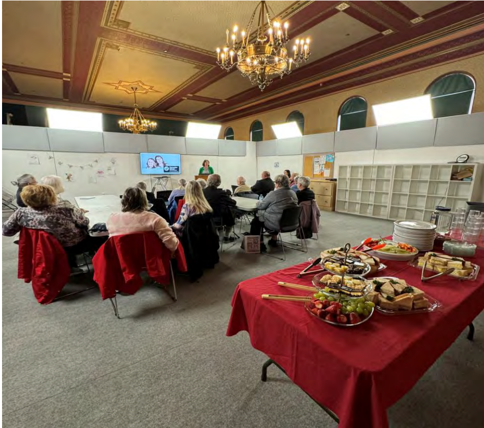
Museum Lunch & Learn