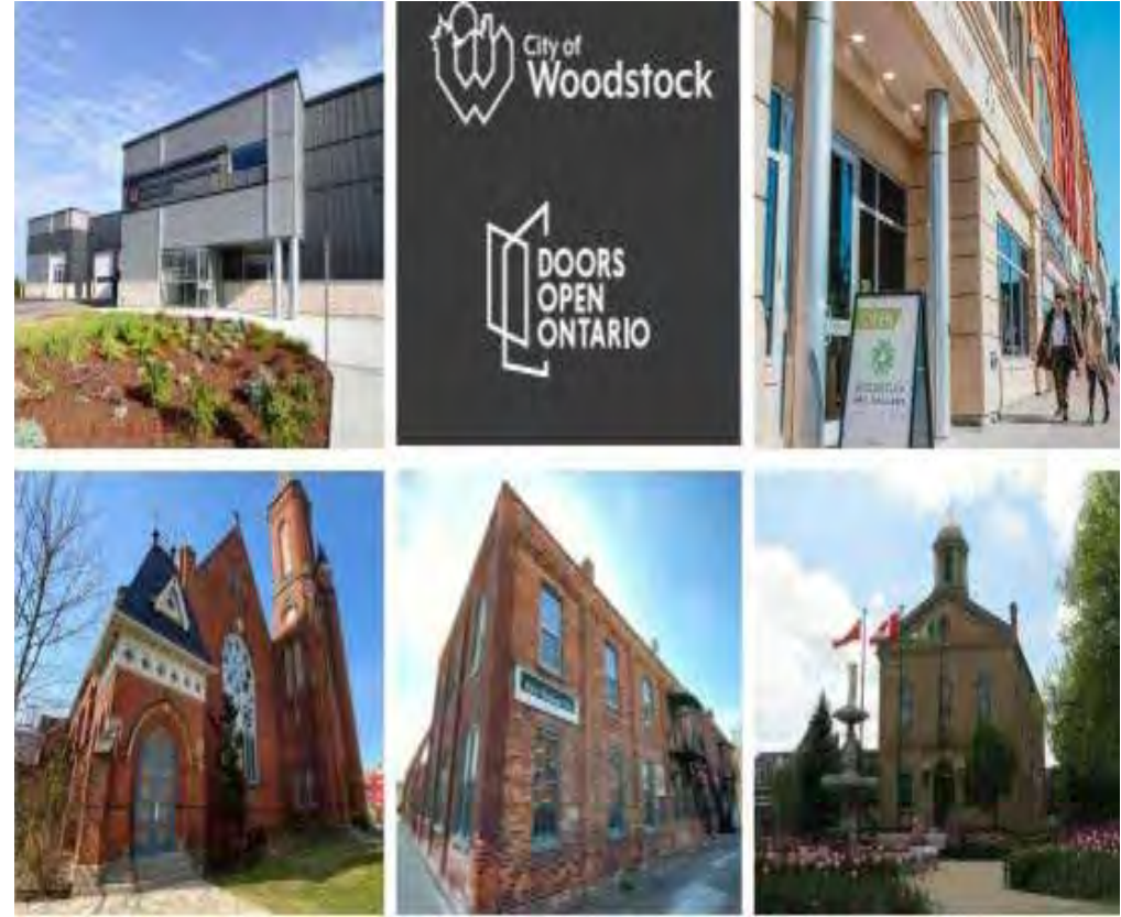
Woodstock Doors Open