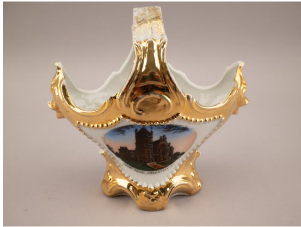
Souvenir of Woodstock Courthouse, 1920c