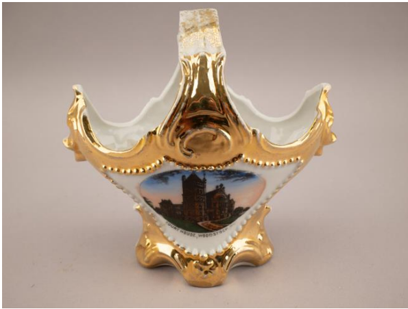
Souvenir of Woodstock Courthouse, 1920c