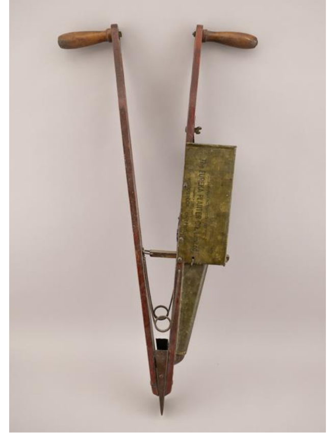
Eureka No. 4 Corn Planter, 1932c