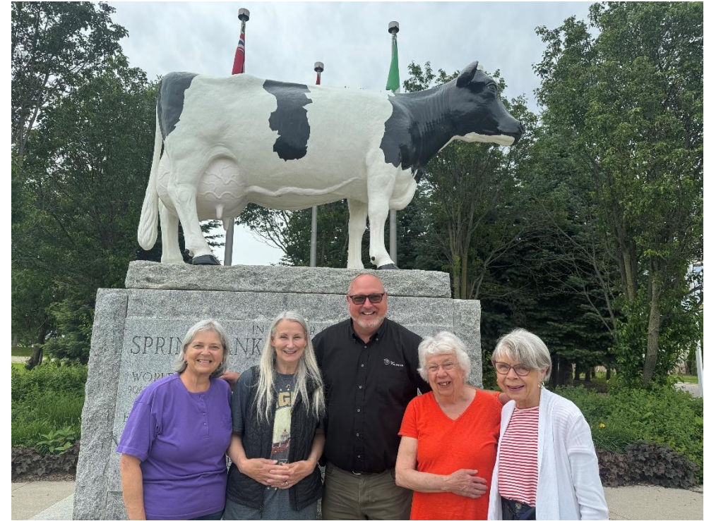
Participants on a stop along the Heritage Bus Tour – June 8, 2024