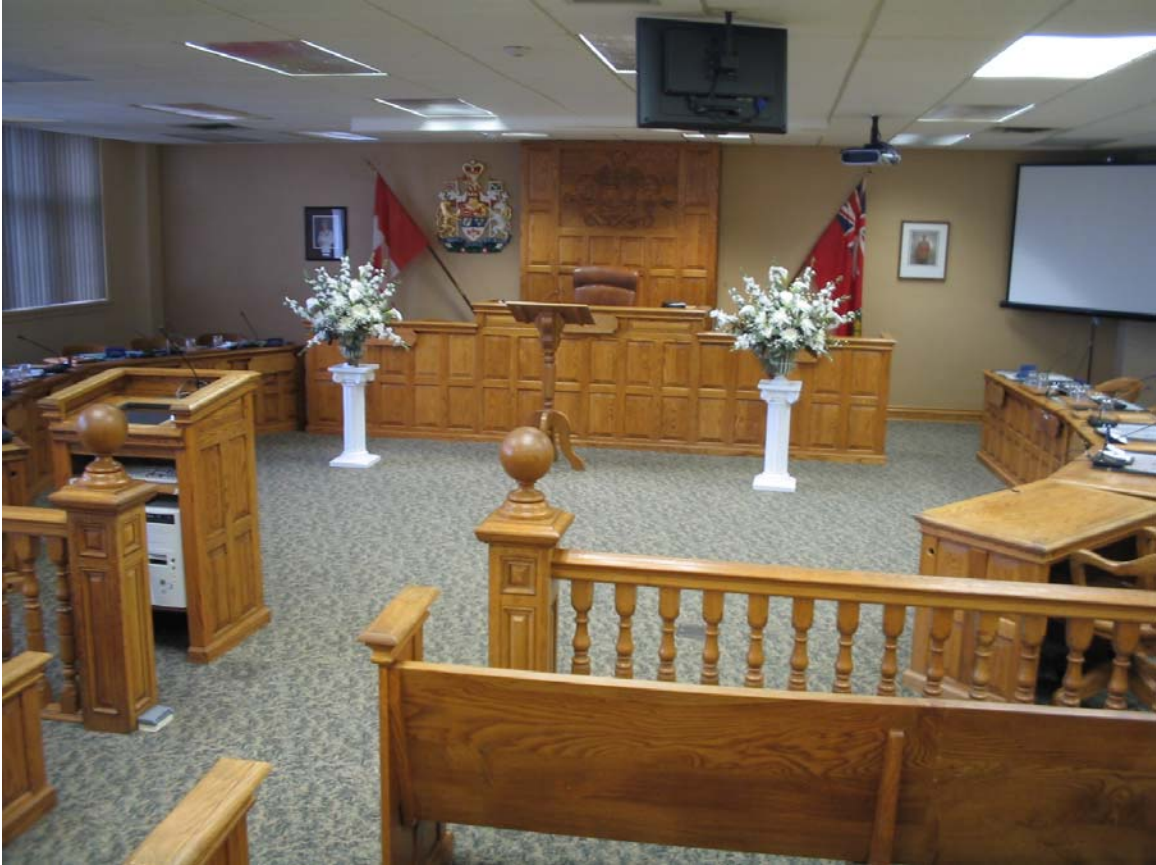
Picture of Council Chambers with floral arrangements