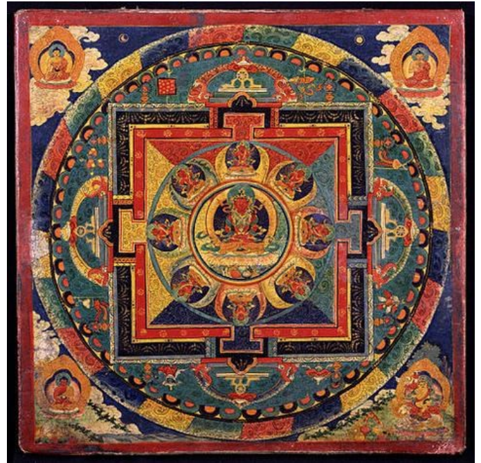
^ Mandala of Amitayus, artist unknown, 19th century Tibetan school

Visual elements are arranged around a central point in the composition, like the spokes on a bicycle wheel. Often, radially balanced designs are circular. Other shapes lend themselves to radial balance as well – squares, hexagons, octagons, stars, etc. Radial balance is prevalent in human designs such as car wheels, architectural domes or windows, clocks, and compasses.